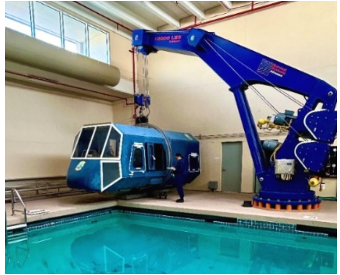
LT Jones conducting a comprehensive safety inspection.