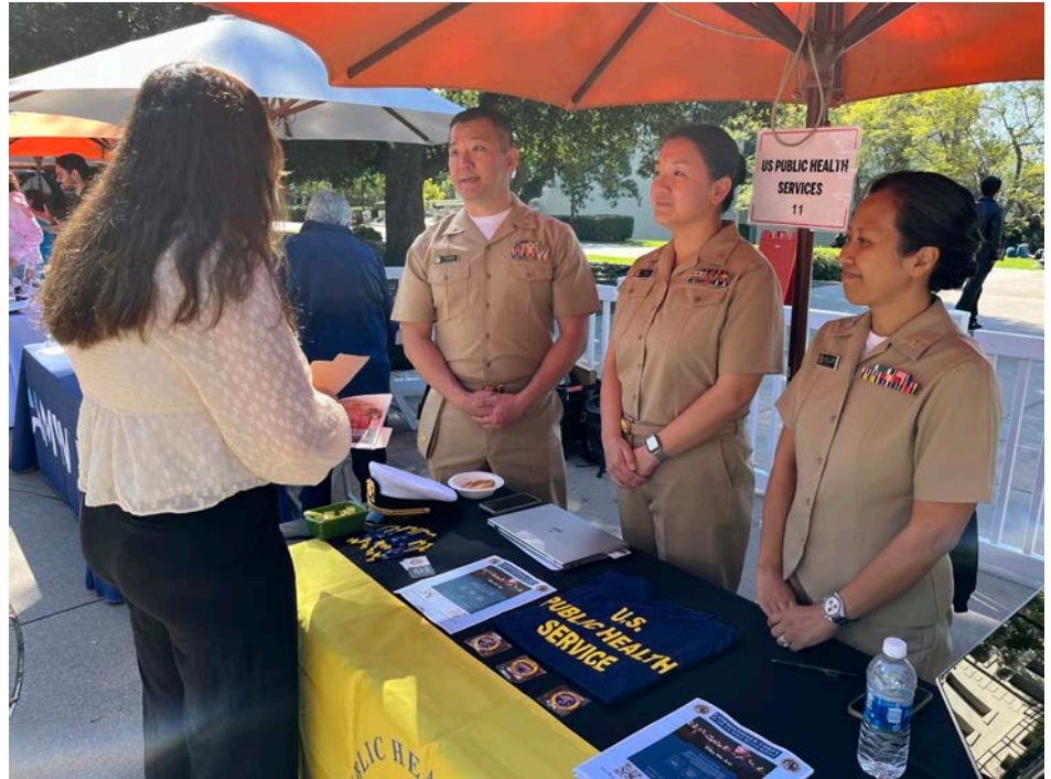
Officers engaged with students in Occidental Community College career fair.

The career fair drew 458 undergraduate student attendees from diverse academic backgrounds. Representatives from over 15 companies and organizations, covering both private and public sectors, were present to engage with students. Among them were the three officers from the Greater Los Angeles COA Branch, who proudly represented USPHS and COA.