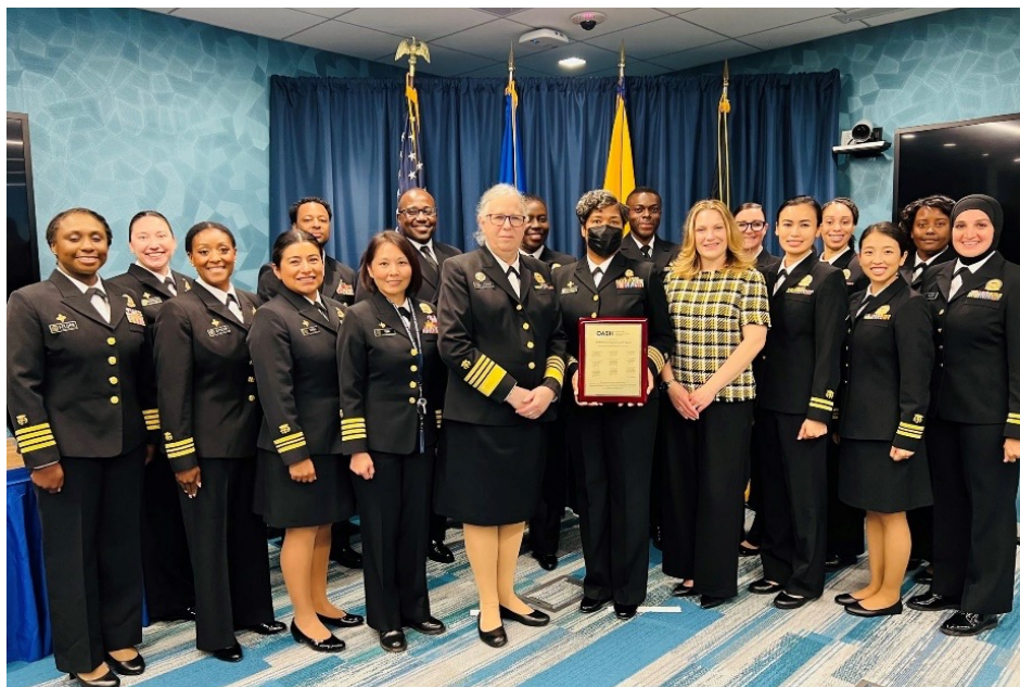
On behalf of PHERST, Region 3 PHERST officers receiving Office of the Assistant Secretary for Health Award from Assistant Secretary for Health Admiral Rachel Levine.

Experience (D-SAFE) and USPHS Regional Deployment Role Training.